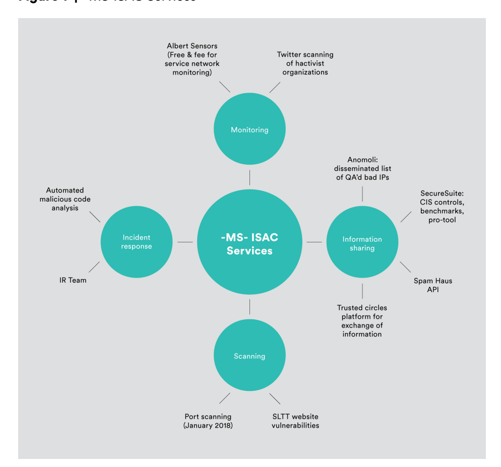
Figure 1 | MS-ISAC Services